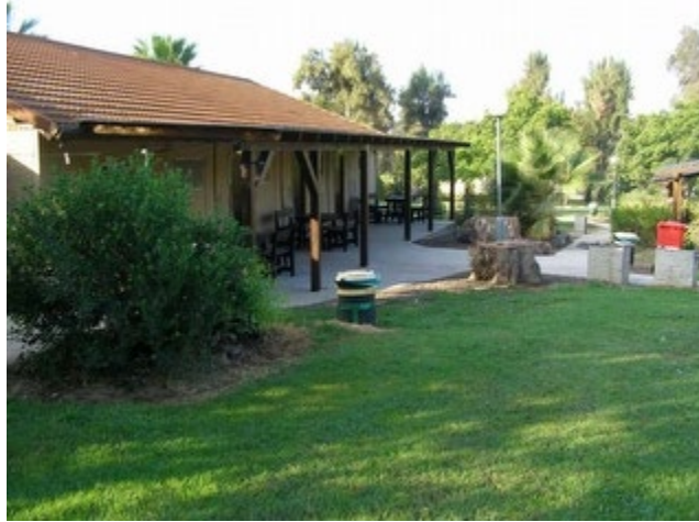
The grounds and lodging units at Kibbutz Kfar Szold

Accommodations: The expedition is housed at Kibbutz Kfar Szold, ca. 12 km/7 mi southeast of the tel at the northern end of the beautiful Huleh Valley. From the kibbutz you have a marvelous view of the Golan Heights to the east, the Naftali Hills to the west, and majestic Mt. Hermon to the northeast. Summer sunsets can be breathtaking! Each air-conditioned unit accommodates 3-4 people and includes a kitchenette, shower, and bathroom. Lawns and porches adjoin the rooms. Free wireless internet is available in the rooms. For more information, visit the kibbutz website www.bakfar.co.il .