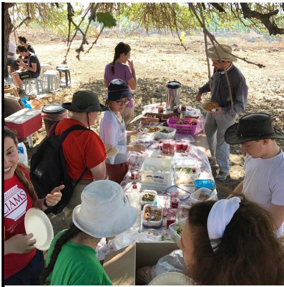
Breakfast on the tell!