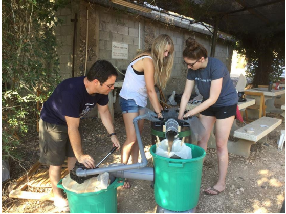
Microarchaeological flotation on the kibbutz