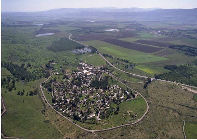
Kibbutz Kfar Szold