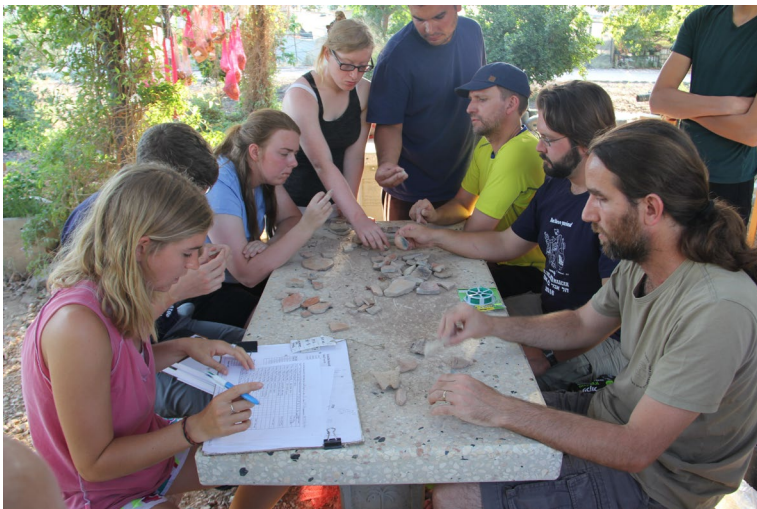
Pottery sorting at the kibbutz